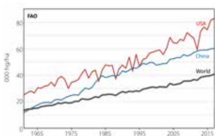
Figure 1: CO 2 is not a pollutant. It is essential to all life on Earth. More CO 2 is beneficial for nature, greening the Earth. It also benefits agriculture, increasing crop yields worldwide, enabling us to address global hunger (crop yield is measured in hectogram/hectare).