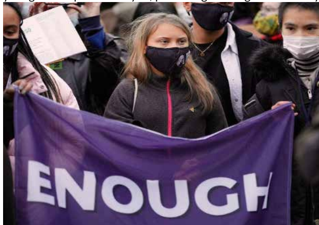
Dear youngsters, why protesting against a problem that does not exist? Just adapt!

But there is more. The past tells us that your parents and grandparents worked hard to build today’s society with an impressively high standard of living. As a result, you are very privileged. You don’t need to live in a slum, can get an education of your choice, can go on holidays every year, can get life-saving medicine when needed, etc., etc. There are many youngsters in the world who have not had that good fortune. Actually, you are living in the best of times ever to be young on our planet. For you, protesting in Glasgow is a luxury!