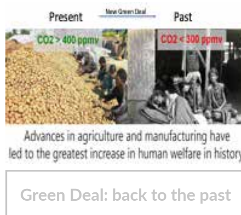
More CO 2 enables future generations to better address global hunger.

Does this mean that the older generation has not made mistakes? Sure, they have made many wrong decisions, but undoubtedly the same will happen to you. Hopefully, you will learn from the mistakes of the past and you will do better than ever before. Building on this inspiring challenge, I have a message for all of you who were present at COP26: